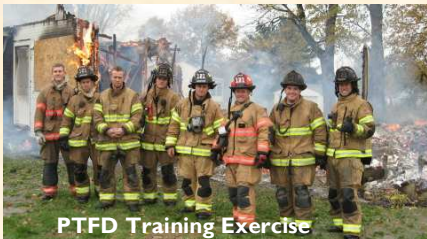
PTFD Training Exercise

Office Hours: 8 a.m. - 5 p.m. Phone: (614) 855-7770 Fax: (614) 855-7761 www.plaintownship.org